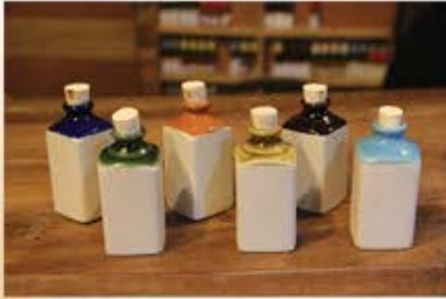
ROOM AMENITIES (SHAMPOO, CONDITIONER)