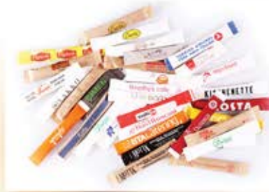
CUSTOMIZED PRODUCTS (TOOTHPICKS, SUGAR SACHETS, MILK POWDER ETC)