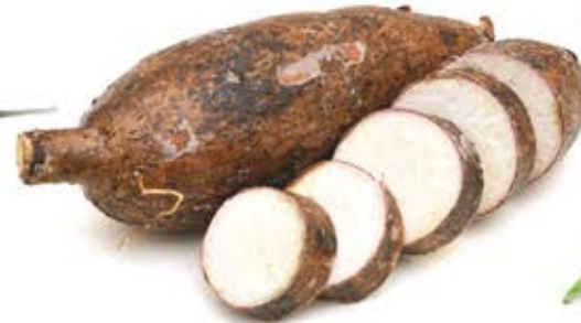
Cassava / Manioc