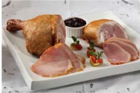
Honey Smoked Whole Duck (Boneless Stuffed)