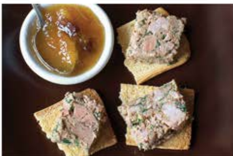
Chicken Liver Pate (Block)