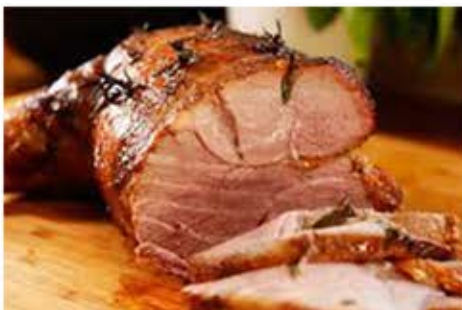
Honey Smoked Mutton Leg (Boneless with Stuffed)