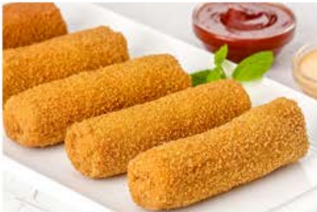
Vegetable Spring Roll (30g)