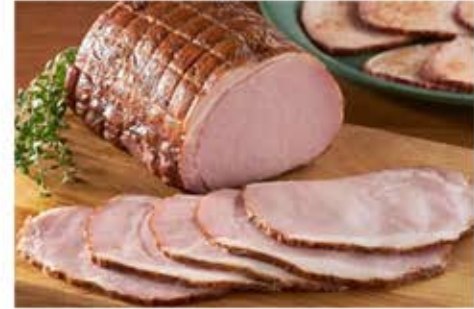
Turkey Ham (Block)