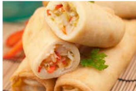
Chicken Spring Roll (30g)