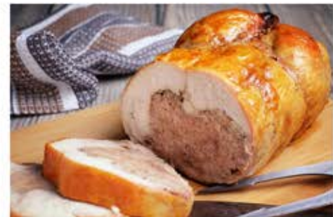
Smoked Turkey Galantine (Stuffed with Nuts & Herbs)