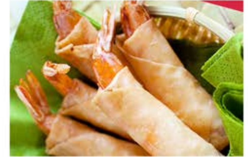
Prawn Spring Roll (30g)