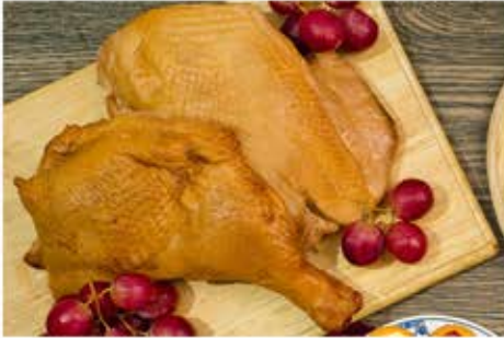
Smoked Turkey Set