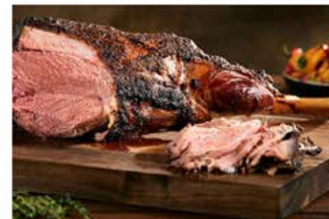
Honey Smoked Lamb Leg (Bone In)