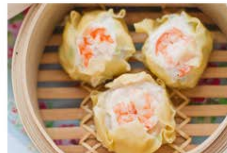
Seafood Shumai (20g)