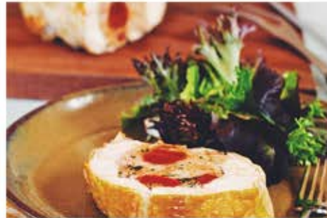
Sea Food Galantine