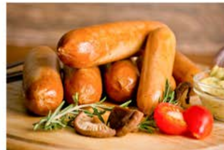
Chicken Bockwurst Sausages (Skin On)