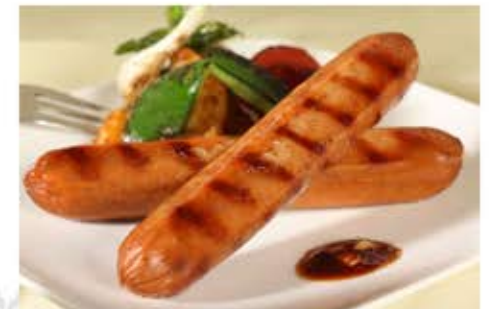
Premium Chicken Breakfast Sausages (S.O.)