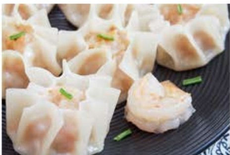
Prawns Shumai (20g)