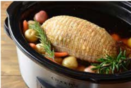
Turkey Roll Netted