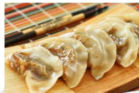
Seafood Dumpling (20g)