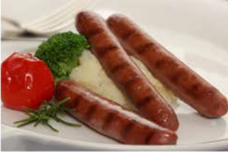
Beef Breakfast Sausages