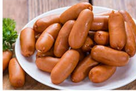
Chicken Cocktail Chilliurst Sausages