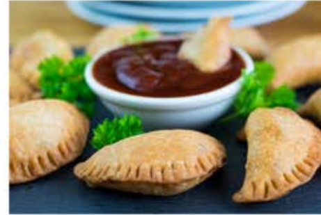
Premium Vegetable Patties (25g)