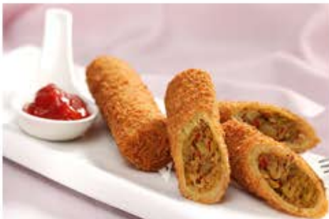
Chicken Roll with Mushrooms & Olives