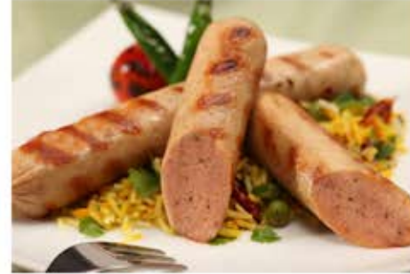
Chicken Chilliurst Sausages