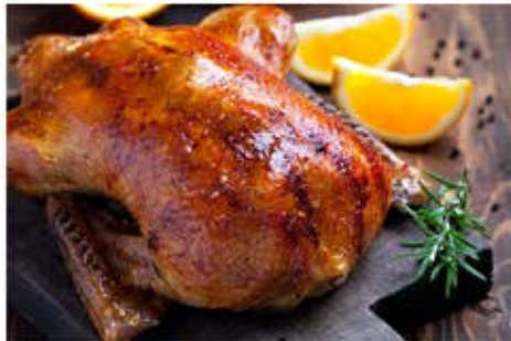
Honey Smoked Whole Duck (B/I)