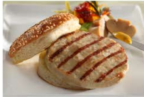
Chicken Burger (70g)