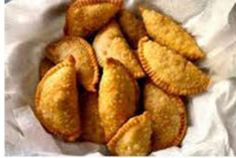
Premium Chicken Patties (25g)