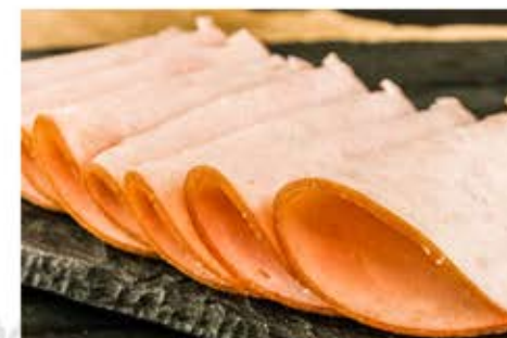
Chicken Bacon (Sliced)