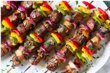
B.B.Q. Beef Kebab