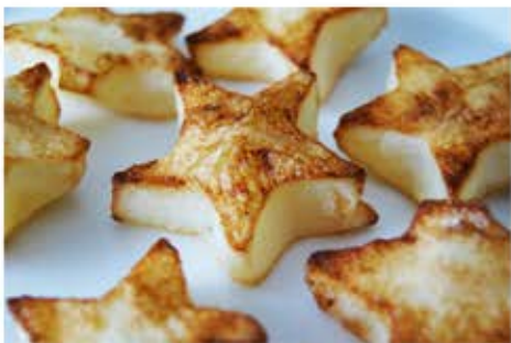
Potato Stars with Cheese