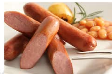
Premium Chicken Sausage Meat