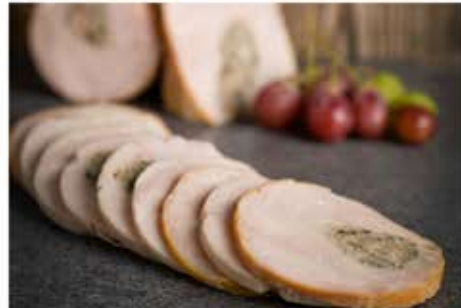
Chicken Gelatine Rolled Breast with stuffing