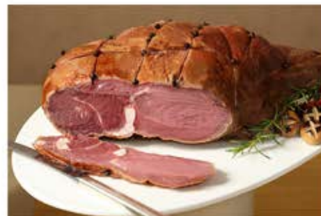
Honey Smoked Lamb Leg (B/L with Stuffed)