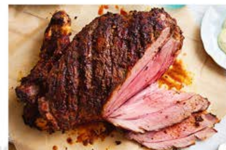
Moroccan Lamb Leg