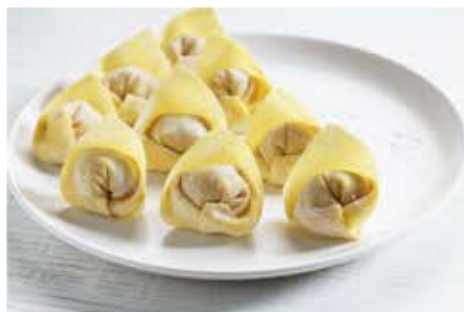
Chicken Dumpling (15g)