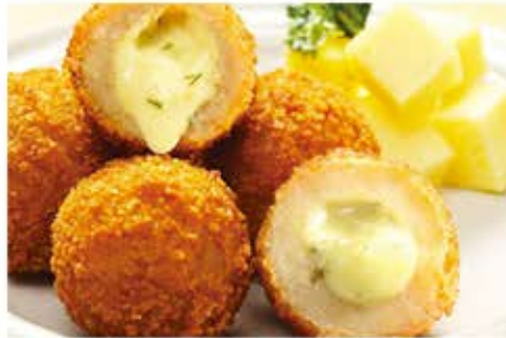
Chicken Mini Kiev