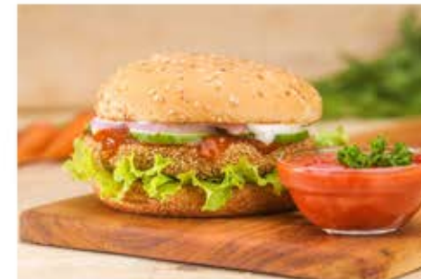
Vegetable Burger (80g)