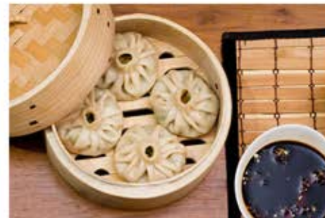
Chicken Steamed Bun (30g)