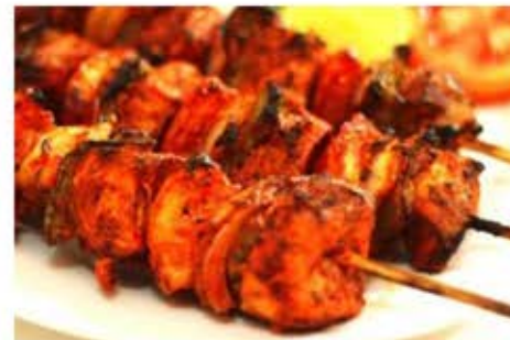
Chicken Tandoori Sticks