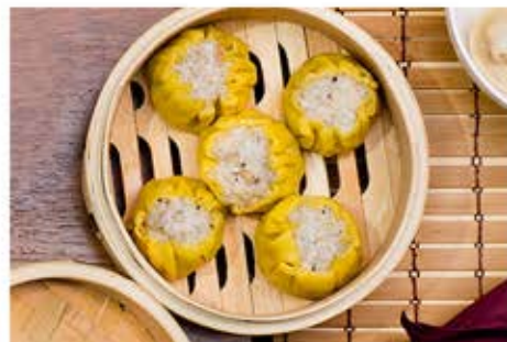
Chicken & Pepper Shumai (20g)