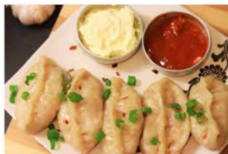
Vegetable Dumpling (20g)