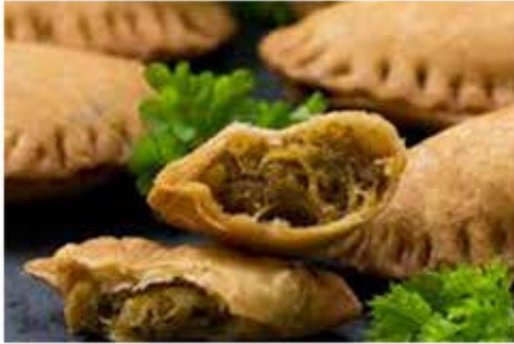
Premium Fish Patties (25g)