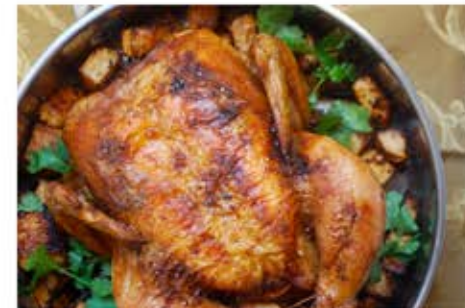
Spicy Whole Chicken