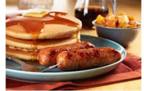
Maple Chicken Sausages (S.O.)