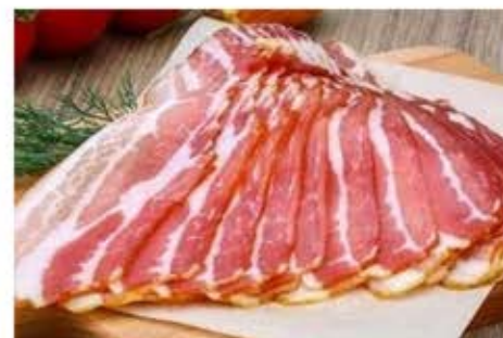
Turkey Bacon (Sliced & Formed)