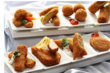
Crumbed Fish Fillet