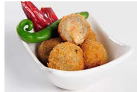
Chicken Kochchi Bites