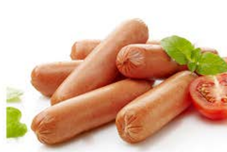
Chicken Kochchi Sausages