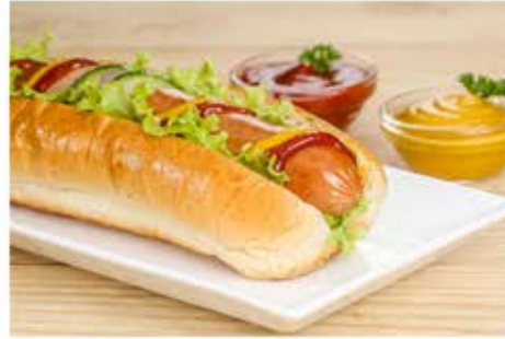
6" Jumbo Chicken Hot Dogs