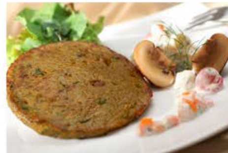
Vege. Grilling Burger (100g)