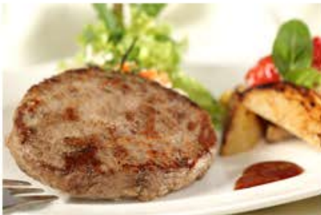
Beef Burger (70g)