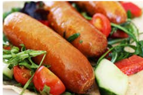
Kochchi & Cheese Sausage