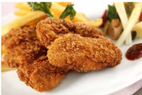
Southern Fried Chicken Thigh