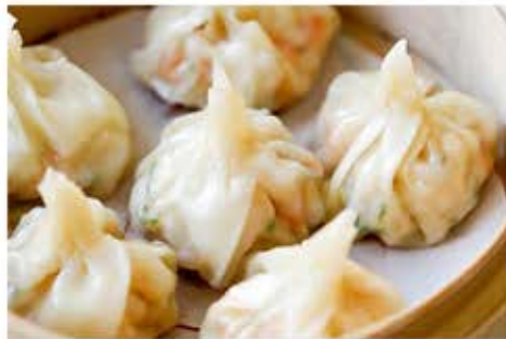
Seafood Wonton (20g)