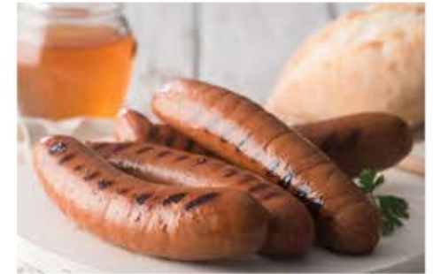
Chicken Honeywurst Sausage