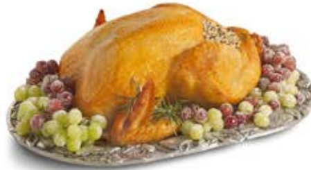
Honey Smoked Whole Turkey (B/L)