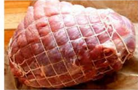
Duck Joint Seasoned & Netted (Boneless - Raw)