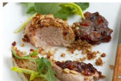
Duck Liver Pate