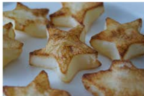
Christmas Potato Shapes (Trees & Angels )