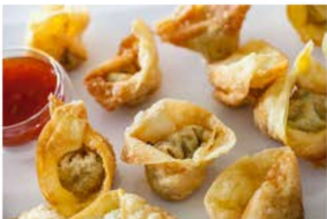
Vegetable Wonton (20g)