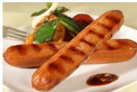
Chicken Sausage Meat