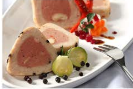
Smoked Duck Galantine (Stuffed with Nuts & Raisins)