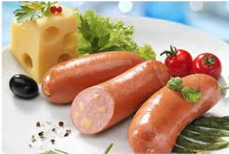
Chicken Cheese & Onion Sausage