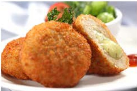
Jumbo Kiev (110g)