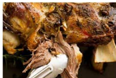
Honey Roasted Whole Goat (Bone In)