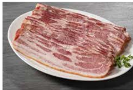
Beef Bacon (Sliced)