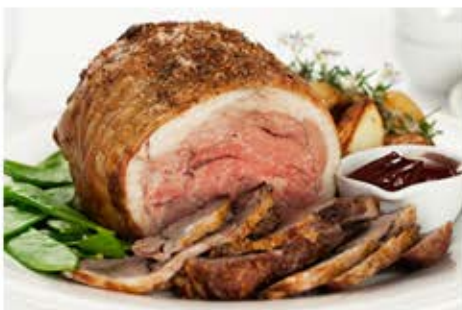
Honey Roasted Lamb Roll (Boneless)