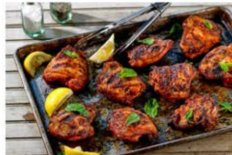
Tandoori Smoked & Roasted Whole Chicken (Bone In)