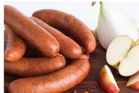
Beef Bratwurst Sausage