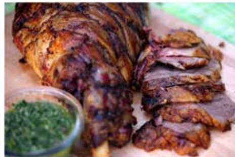
Honey Smoked Mutton Leg (Bone In)