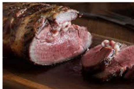
Honey Roasted Whole Goat (Boneless)