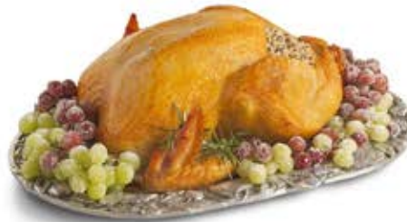
Honey Smoked Whole Turkey (Stuffed - B/L)