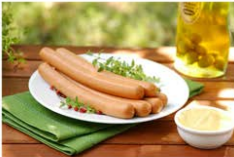
Chicken Knackwurst Sausage