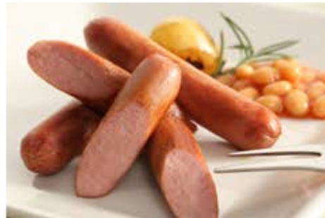
Premium Chicken Sausage