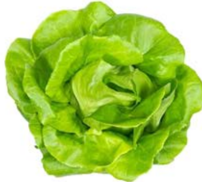
Lettuce Green Butterhead

Known for its incredibly sweet and mellow flavour, nutty with a buttery texture and burgundy-red stained, elongated, lobed and loosely serrated, similar to the leaves of an oak tree