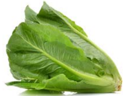
Lettuce Romaine / Cos

Have crumpled looking leaves that resemble flower petals. Butterhead lettuce is usually deep green.