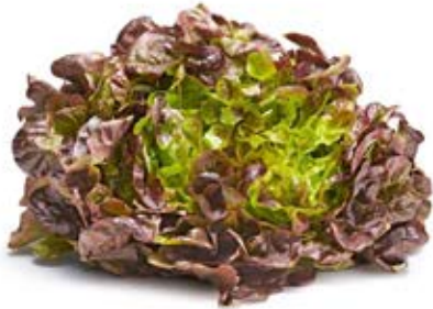
Lettuce Red Oak

Known for its incredibly sweet and mellow flavour, nutty with a buttery texture and burgundy-red stained, elongated, lobed and loosely serrated, similar to the leaves of an oak tree