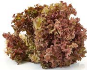
Lettuce Lollo Rosso (Red cut)

Strongly incised tender leaves. The leaves are bright green and have an attractive appearance.