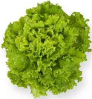
Lettuce Lollo Bionda (Green cut)

Strongly incised tender leaves. The leaves are bright green and have an attractive appearance.