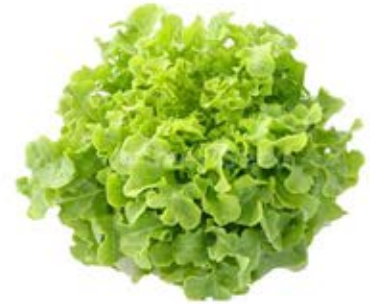
Lettuce Green Oak

A classic Italian lettuce, with dark copper red, crinkled frilly leaves. It makes a colourful addition to salads, and has a refreshing taste.